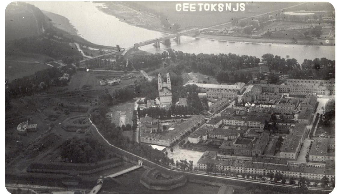
View of Daugavpils Fortress in the 1920s